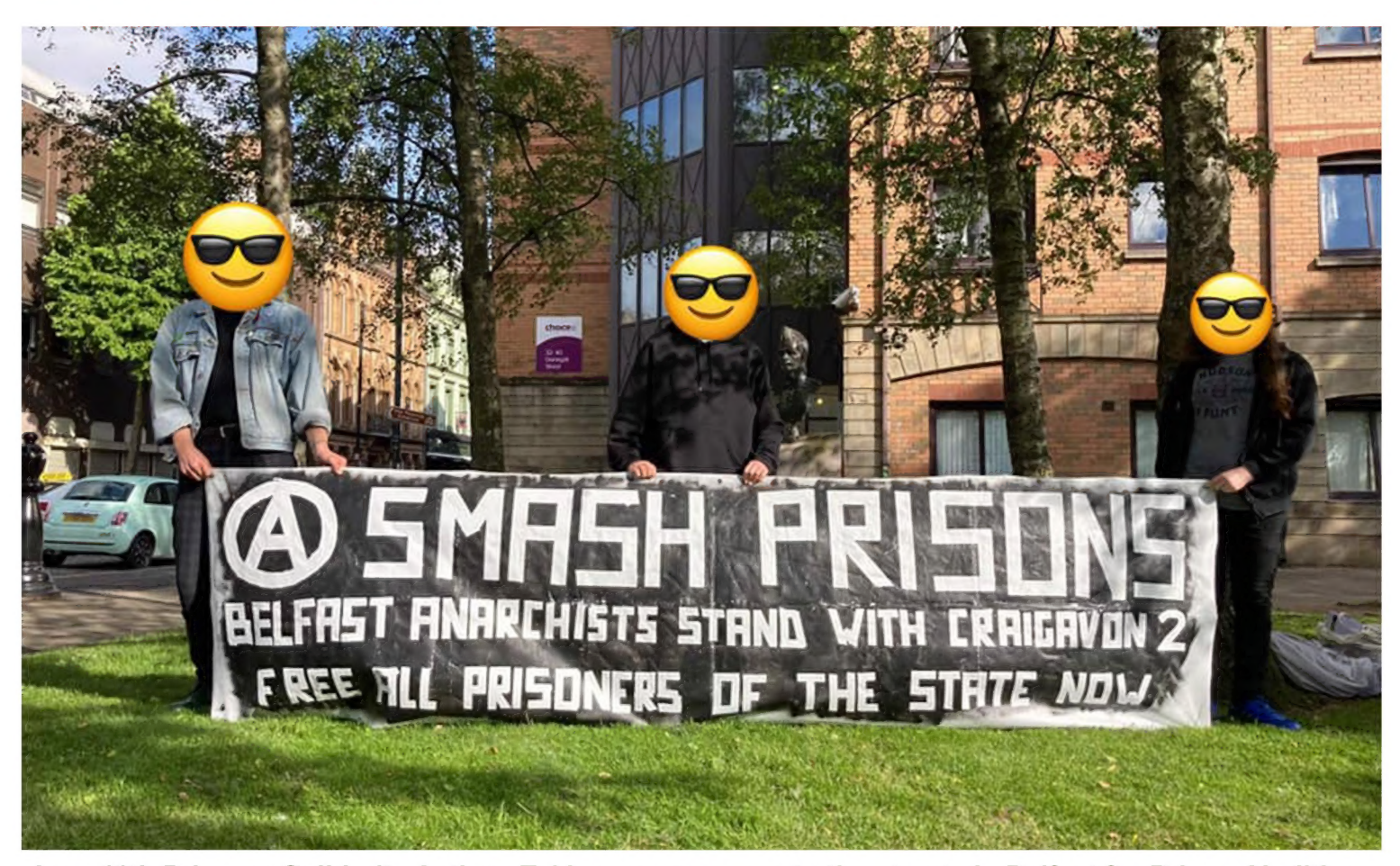
June 11th Prisoner Solidarity Action: Taking our message to the streets in Belfast for Prison Abolition

We talk to Belfast Anarchists who are helping to build working class resistance on the streets and in the workplace!